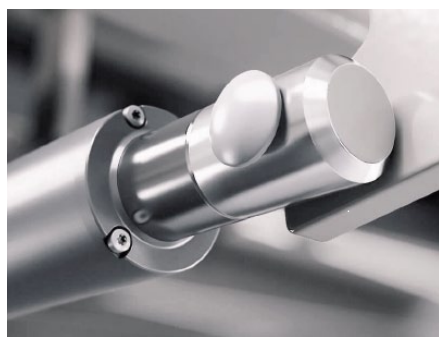
Electric SYSTEM Taiwan motor, Noise under 50dB, with lifetime 20,000times moveme