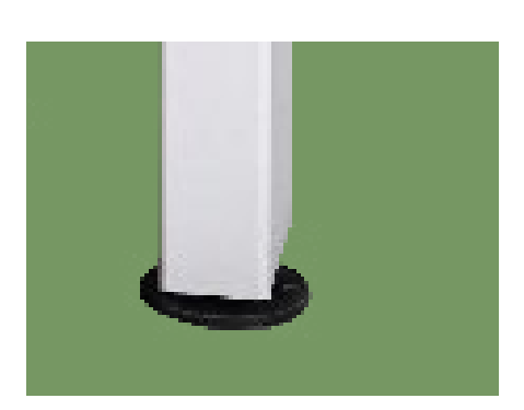
Engineering ABS material plug, foot pad