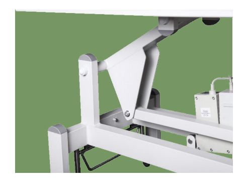
Metal Material Baosteel from Fortune Global 500 Panasonic Robotic ensure 360° full smooth wedlding