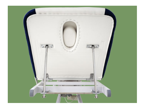
Back adjust Back adjust can choose rachet or motor