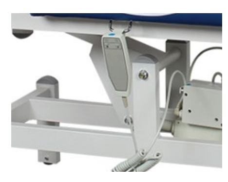
Hand controller, keep qualified after 2000 times use