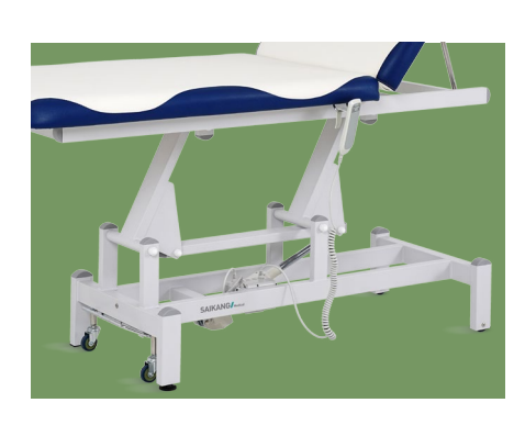
1.2-1.5 mm Thickness powder coated steel frame, 150 kg bear loading