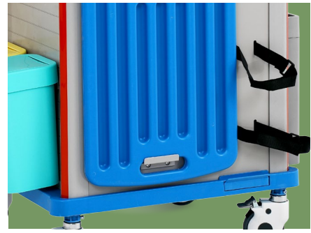
Inserted oxygen bottle holde Inserted retractable oxygen bottle holder, belts fixed on trolley main body, space saving

The power socket is movable and detachable, easy to use, located above the CPR board to convenient the use of oxygen cylinders