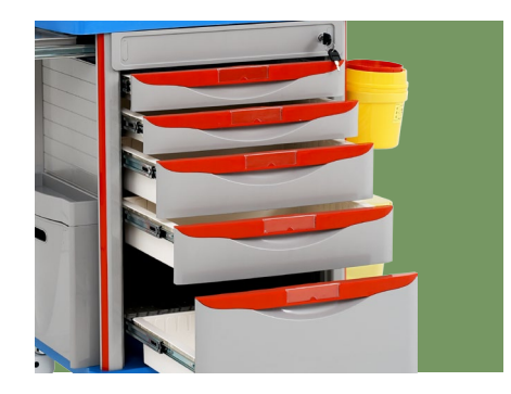
Drawer Drawer insize big & deeper!

Heavy duty construction Wheels assembled on the same vertical line as four columns. More stable, even the drawer open inside full of medicine/tools.