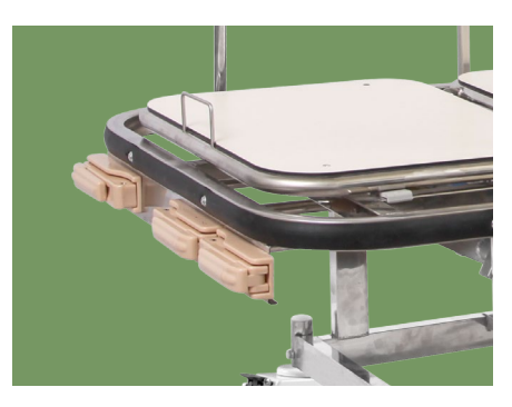
Handle Crank The bed with three function, controlled by manual crank

The stretcher surface made by phenolic compact board.much thinner and easier to X- ray