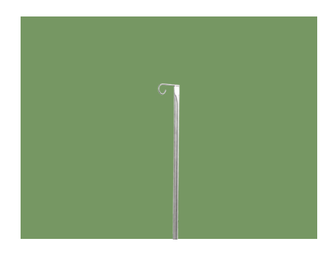
Adjustable stainless steel I.V pole, outside diameter \Phi 19*1,Inside diameter \Phi 16*1,Load capacity: 5KG,F, fixed deviced was added and eusure the I.V pole will be very stable with no shaking.