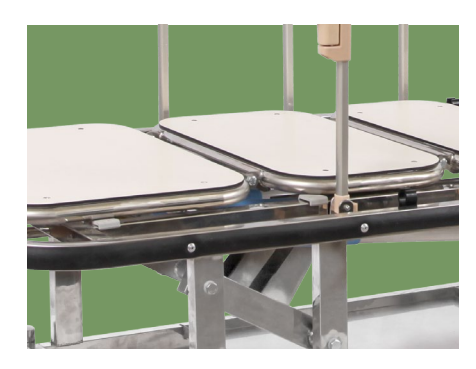
Bumper Strip The bumper strip add extra 6pcs rivets on each side to make sure the fastness.