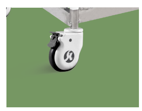
5' silence caster, advanced protection universal brake wheel, easy to move, simple to operate, reliable performance

Aluminum alloy side rail,5-staff, knocked-down type, Tight by screw, easy to change if it is broken.