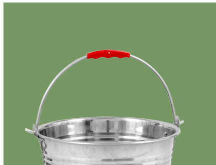
Handle Red plastic handle for added friction for easy lifting