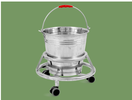
Material 3mm stainless steel plate