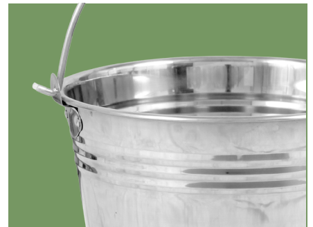
Hook Rubber sleeve at the hook to prevent falling off and prevent scratching