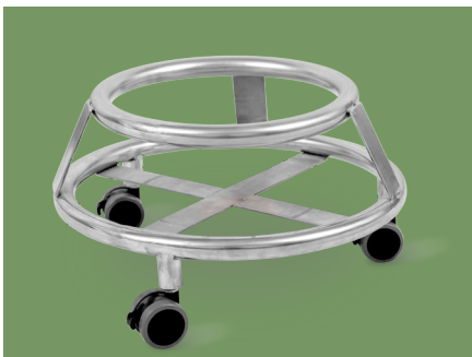
Base Removable stainless steel base, \Phi 25 \times 1.2 mm stainless steel round tube