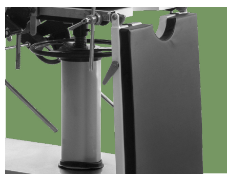
Leg board Leg board can be folded down by adjusting the small handle. Leg board down: max. to 90°.