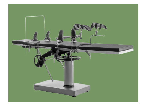
Structure Full mechanical structure. Simple maintenance, low failure rate.