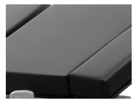
Table top is made of steel through epoxy painting, ASTM testing anti-baterial.

Base structure is made of high-quality 304 stainless steel, robot welded with high strength and modern appearance.