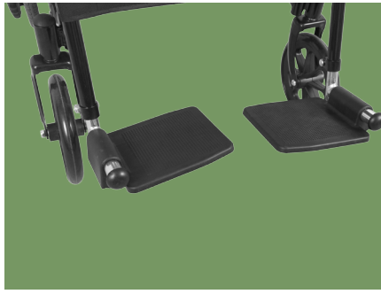
Pedal Plastic foot panel, rotatable.