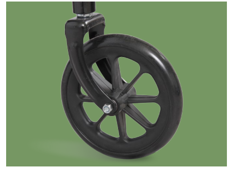
Front Wheels 8" front wheel, flexible flexible change direction.