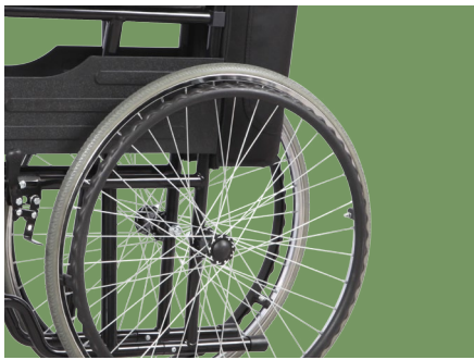
Rear Wheels 20" wheel, adapt to all kinds of pavement.