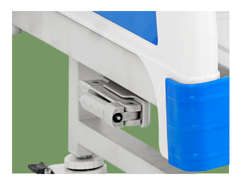
Crank Retractable ABS crank handle

Simple and elegant bed head and foot shape, easy to disassemble and install, with medical record card at the foot of the bed.