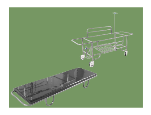
stretcher and trolley Separated into two parts: stretcher and trolley