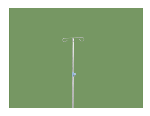
Stainless steel I.V pole, diameter \Phi 16*1,load capacity: 15KG