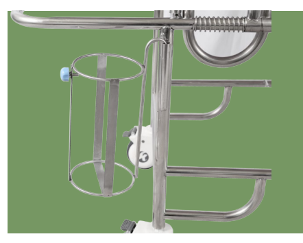
Oxygen bottle rack (stainless steel)