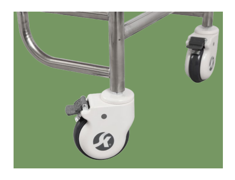
5' covered caster. Advanced protection universal brake wheel, easy to move, simple to operate, reliable performance